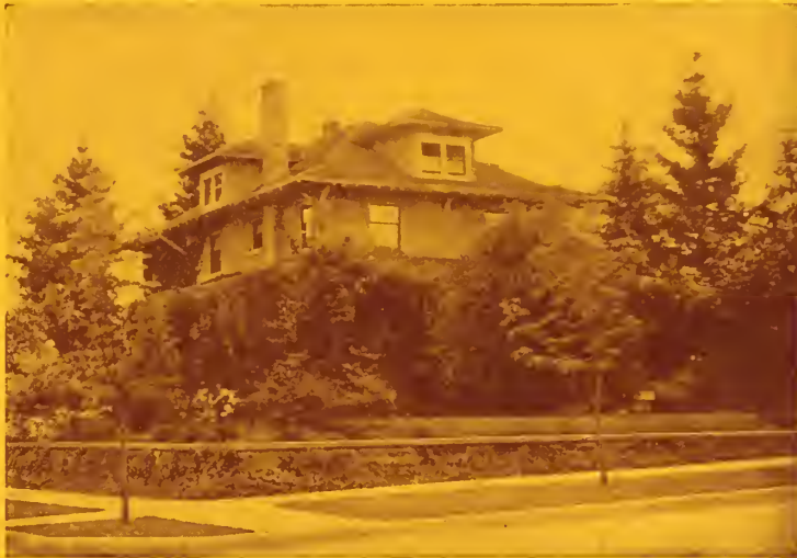
HOME OF THE MASTICK DAHLIAS

Are distinctly original and famous for their wondrous beauty of form and coloring